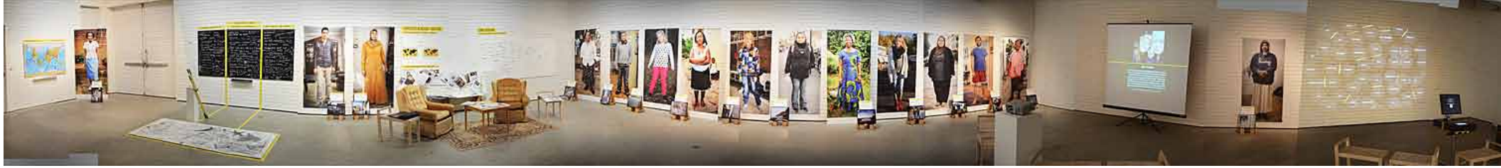
Panorama view of the first Vision Exhibition at the Steneby School of Design and Craft, Sweden, in November and December 2013.

Partners for this exhibition and seminar: