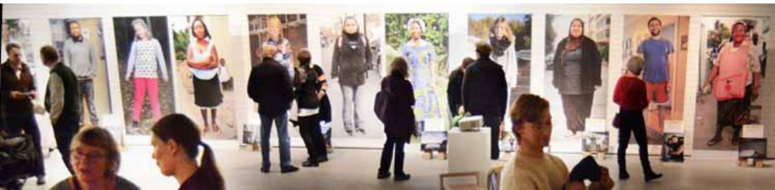
1. On the main wall fifteen, 7’ tall, portraits of participants in Bordr-projects show one border photograph and one story each.

The design shown here is preliminary and will be ultimately decided when we work in the space. All the modules are, however, already in existence and tested.