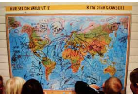
3. A whiteboard world-map to draw new borders and countries to make your own world.