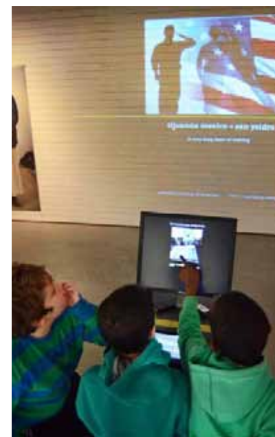
5. An iPad with the Bordr app, ask: “What border have you crossed” - “here- there” inputs are followed by experience questions. Live border pairings and visualizations shown on the data connected flat-screen TV.