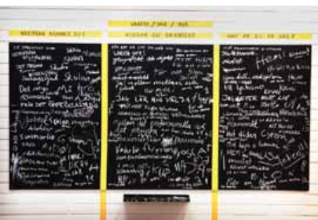
2. “Where do you come from”, “where are you going”, and “where/how/why do you cross the border” - interactive Bordr blackboard.